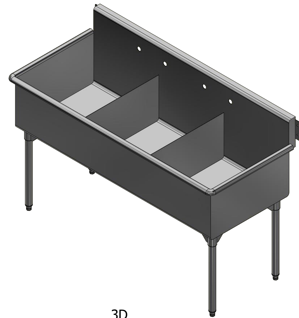
3D SCALE 1/12