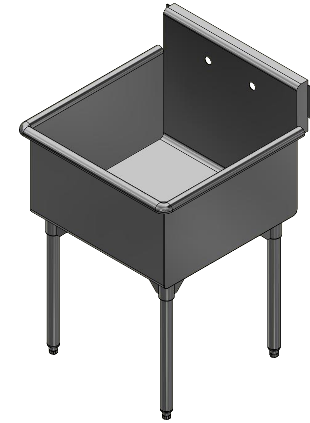
3D SCALE 1/12